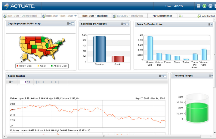
An Actuate BIRT 360 self-service operational and analytical dashboard for Cúram Software customers to get the most out of their embedded Eclipse™ BIRT reporting engine.